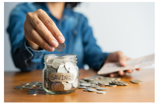
Sign up for Pocket Change and let every debit card transaction round up to the next dollar, depositing the extra change into your savings. It's the easiest way to grow your savings - learn more <u>here!</u>