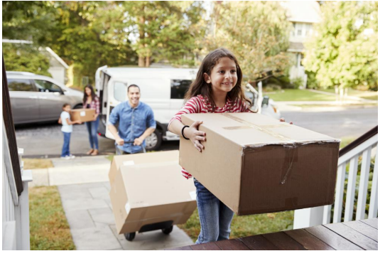
Are you house hunting? Understand how to make an offer and close the deal with our helpful resources. Access essential home buying resources <u>here!</u>