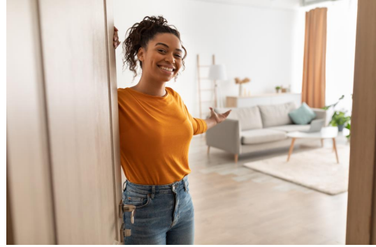
From first-timers to seasoned renters, everyone needs a budget when apartment shopping. Find out how to budget effectively for your next apartment <u>here!</u>