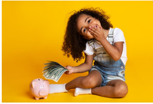
Grow your kids' savings now! Starting early with good money habits is invaluable. Explore different strategies to help build your kids' savings <u>here!</u>