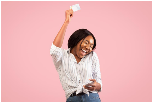
Unsure what to look for when applying for a credit card? They're not all the same! Find out how to select the best card for your needs. Discover how <u>here!</u>