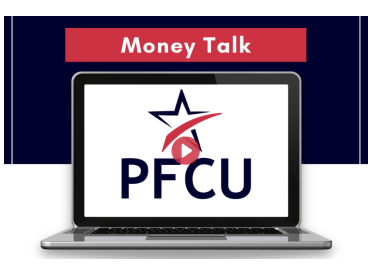
We're excited to introduce Money Talk! These quick videos will cover a range of financial topics to help you learn new skills and manage your finances! Check it out <u>here.</u>