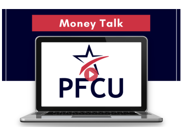
We're excited to introduce Money Talk! These quick videos will cover a range of financial topics to help you learn new skills and manage your finances! Check it out <u>here.</u>